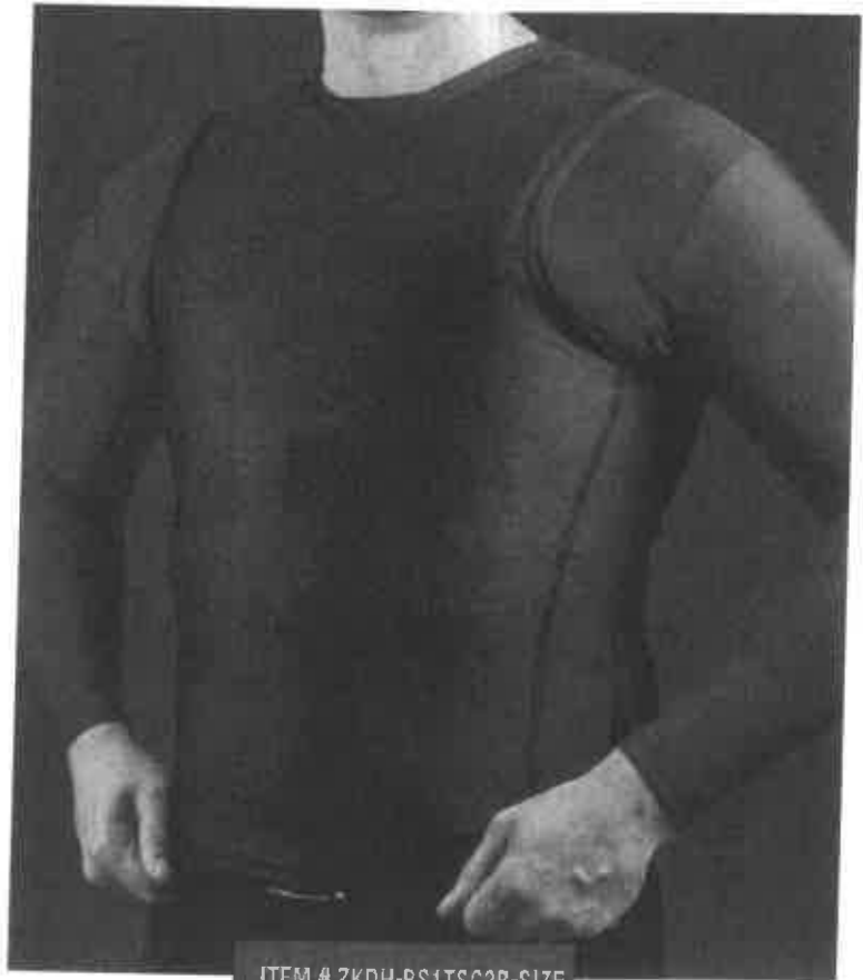
ITEM # ZKDH-BS1TSC2B-SIZE