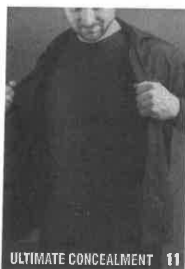
ULTIMATE CONCEALMENT 11