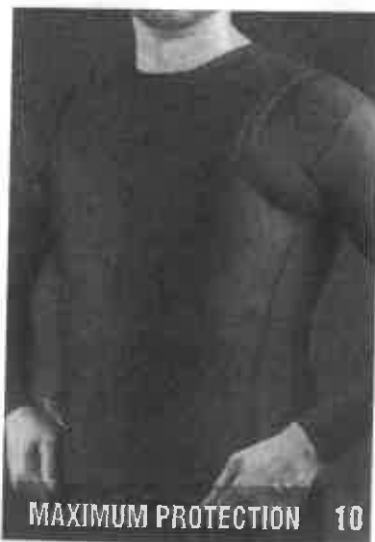
MAXIMUM PROTECTION 10